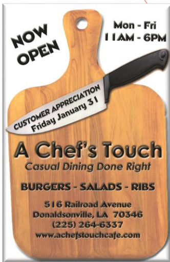
FLYER/LOGO A Chef's Touch Cafe, Donaldsonville, LA